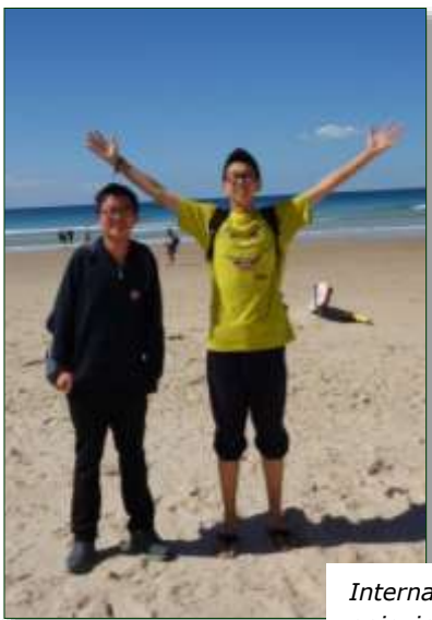
International students enjoying a day at Surfers Paradise Beach, one of Queensland's iconic beaches.

Your Australian family will help organise a travel card for you – this is called a GO Card.