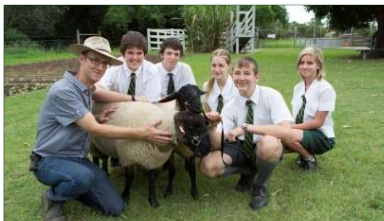
Students with the school Farmer and some sheep from our Farm