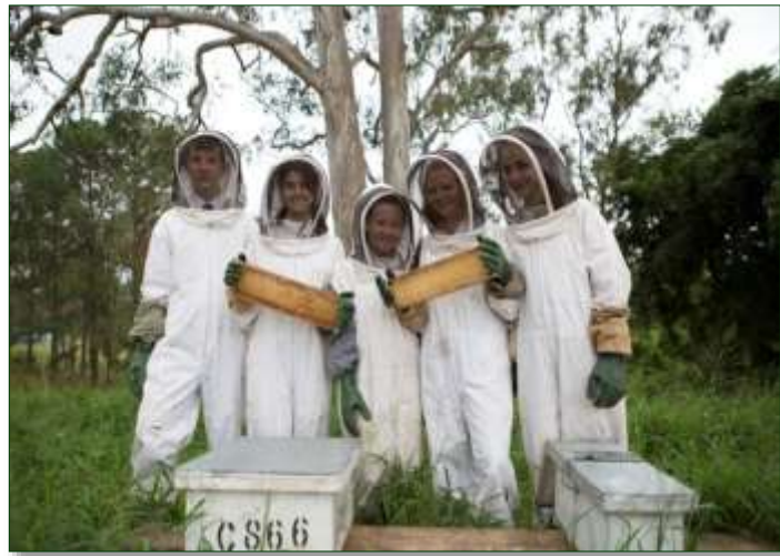
Fresh produce from our vegetable garden (left); and collecting honey from our bees (right)