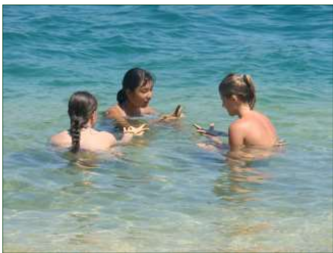
International students who stayed at Tangalooma Island Resort on Moreton Island.

However your homestay family and your host family must grant permission for you to stay.