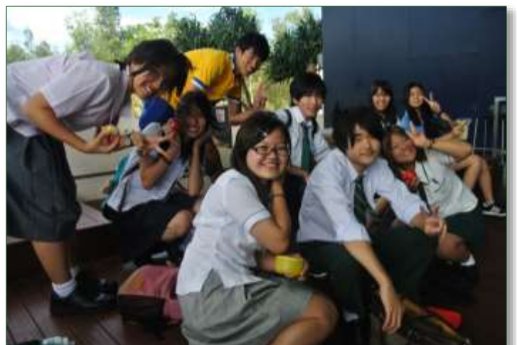
International students enjoying some leisure time together

Guidance and counselling is also available to you through the school's Guidance Officer.