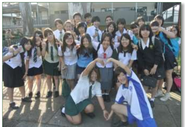
A very happy group of Japanese International Students.