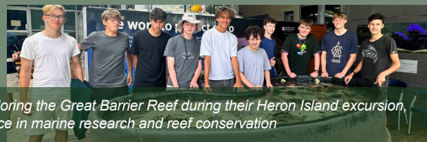
Corinda SHS students exploring the Great Barrier Reef during their Heron Island excursion, gaining hands-on experience in marine research and reef conservation