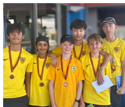
Corinda SHS's Junior Tennis Team place third at the State Championships