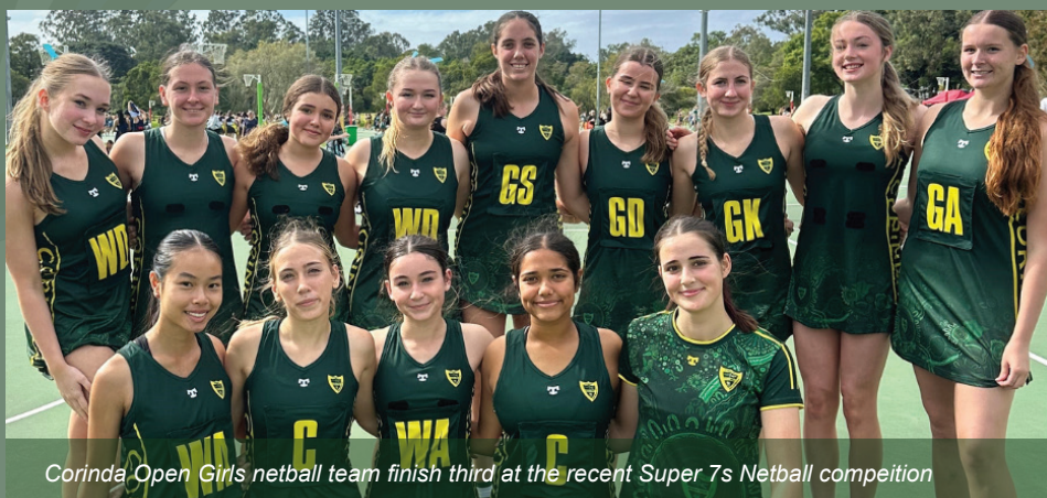
Corinda Open Girls netball team finish third at the recent Super 7s Netball competition