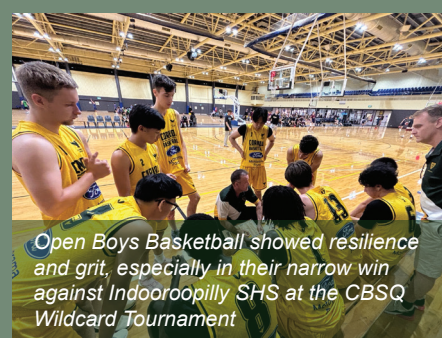
Open Boys Basketball showed resilience and grit, especially in their narrow win against Indooroopilly SHS at the CBSQ Wildcard Tournament