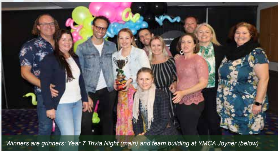
Winners are grinners: Year 7 Trivia Night (main) and team building at YMCA Joyner (below)